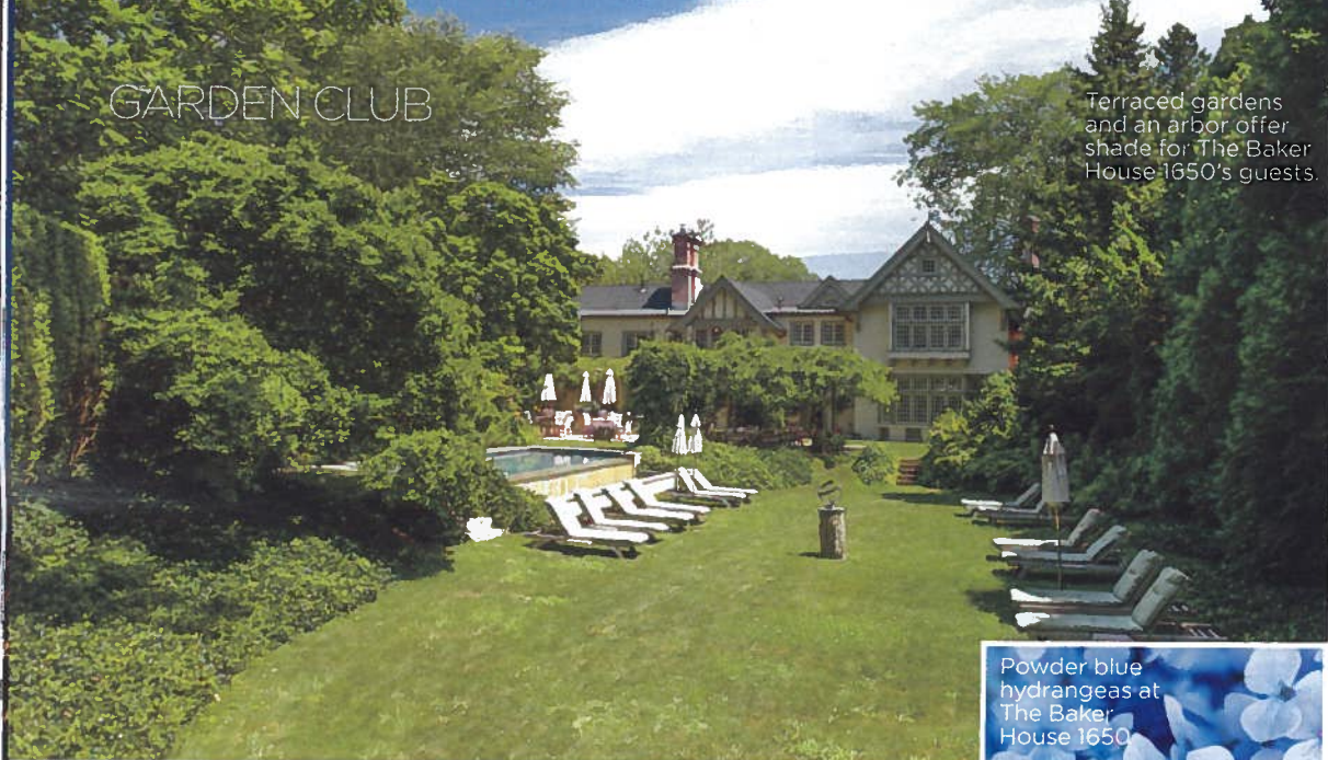
Terraced gardens and an arbor offer shade for The Baker House 1650's guests.