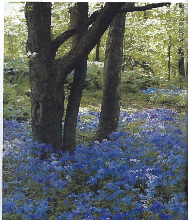
(BAKER HOUSE, WINDMILL LANE)