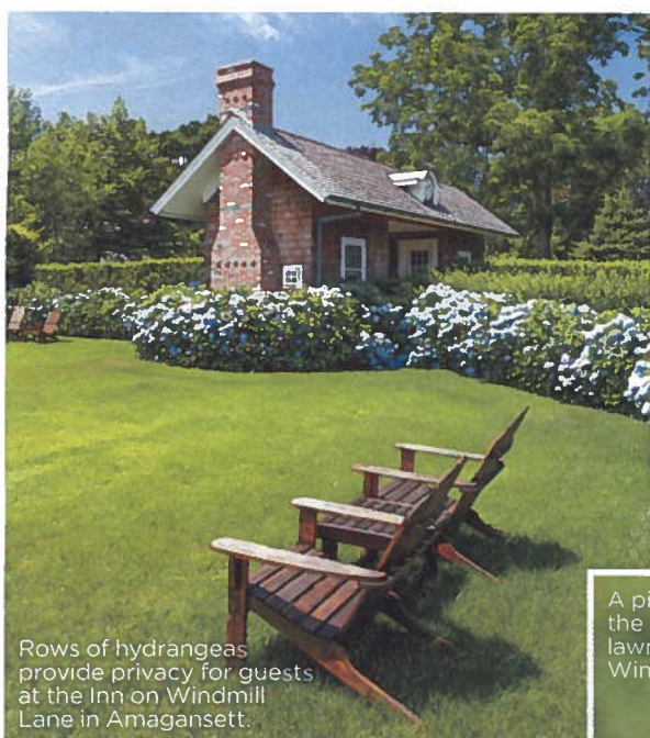
Rows of hydrangeas provide privacy for guests at the Inn on Windmill Lane in Amagansett.