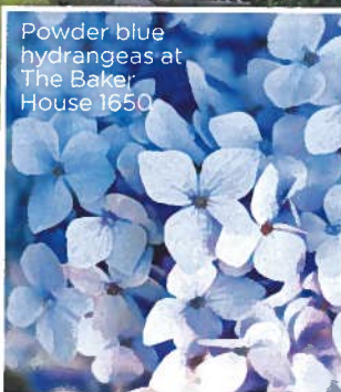
Powder blue hydrangeas at The Baker House 1650.