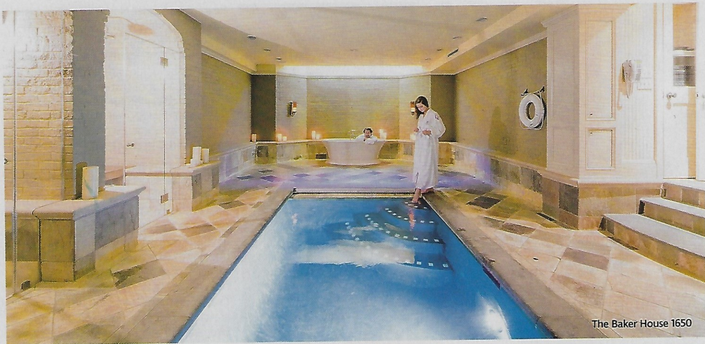
The Baker House 1650

Whether you are looking for the ultimate girls getaway or a tranquil escape to unwind and reset, Long Island's luxe spa treatments offer the perfect indulgence.