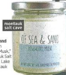
montauk salt cave