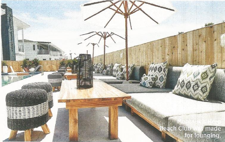
Just off the beach, Hero Beach Club is made for lounging.